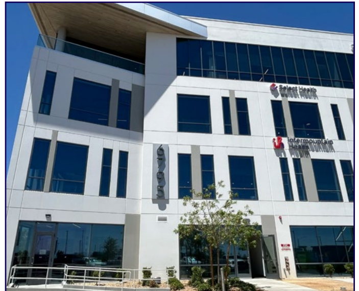
HQ Building: The Select Health Nevada headquarters and Intermountain Maule Clinic are housed together in a new 20,000-square-foot building in Las Vegas, Nevada.

Article based on "Better together: Select Health and Intermountain open new headquarters and clinic in Nevada" by Joe Gaccione, Intermountain Health Caregiver Brief , June 27, 2024.