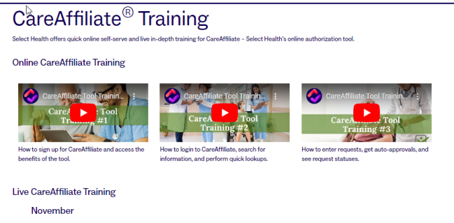
Figure 2. Choose from Training Videos or Live Sessions